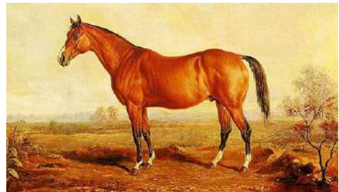
Lexington , by Edward Troye