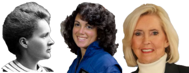
Marie Curie Judith Resnik Lilly Ledbetter

Over the years AAUW has funded a highly esteemed fellowship and grant program, awarding over 70 million dollars to women scholars and various programs for women in the US and overseas. AAUW supported Dr. Marie Curie, the first woman to win the Nobel Prize; Judith Resnik, the second woman to travel in space; and Lilly Ledbetter, equal pay advocate and sponsor of the 2009 Fair Pay Act.