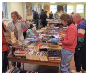
Book Sale Day