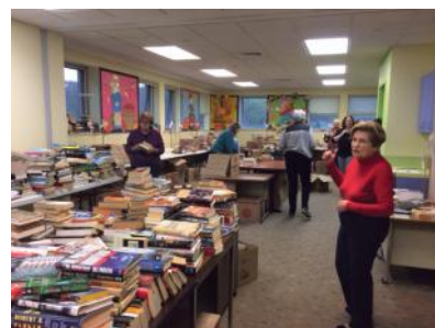
Super Sort Day